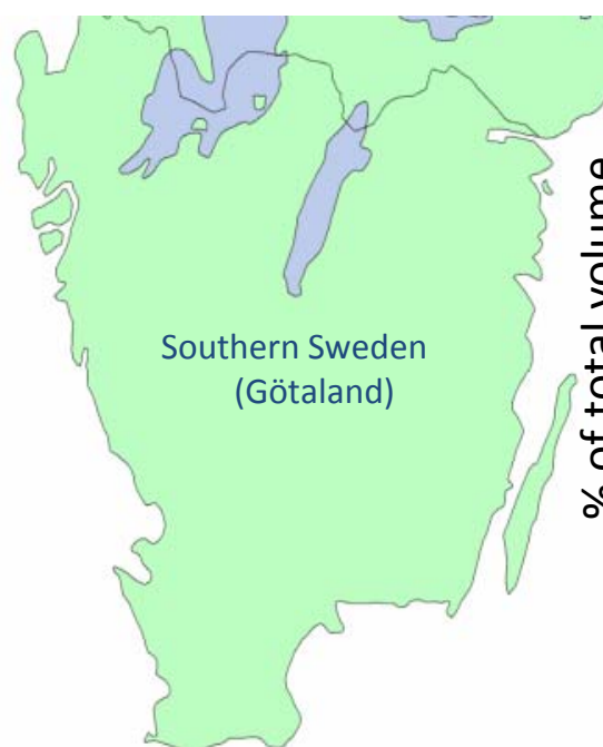
Change in tree species growing stock for the <15 cm diameter class (SFA 2008)