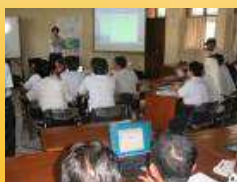
Lectures and discussion with prominent scientists