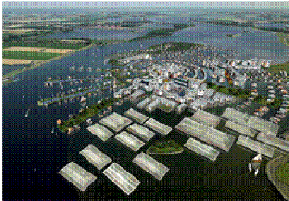
The summer school will include an excursion to look at adaptive strategies to cope with impacts of global change.

Active discussion with the lecturers will be stimulated by asking participants to prepare propositions for each lecture. Interaction with lecturers and fellow participants will be further stimulated by poster presentations. Finally, a small group assignment will encourage discussion of the lectures, guided by topical questions.